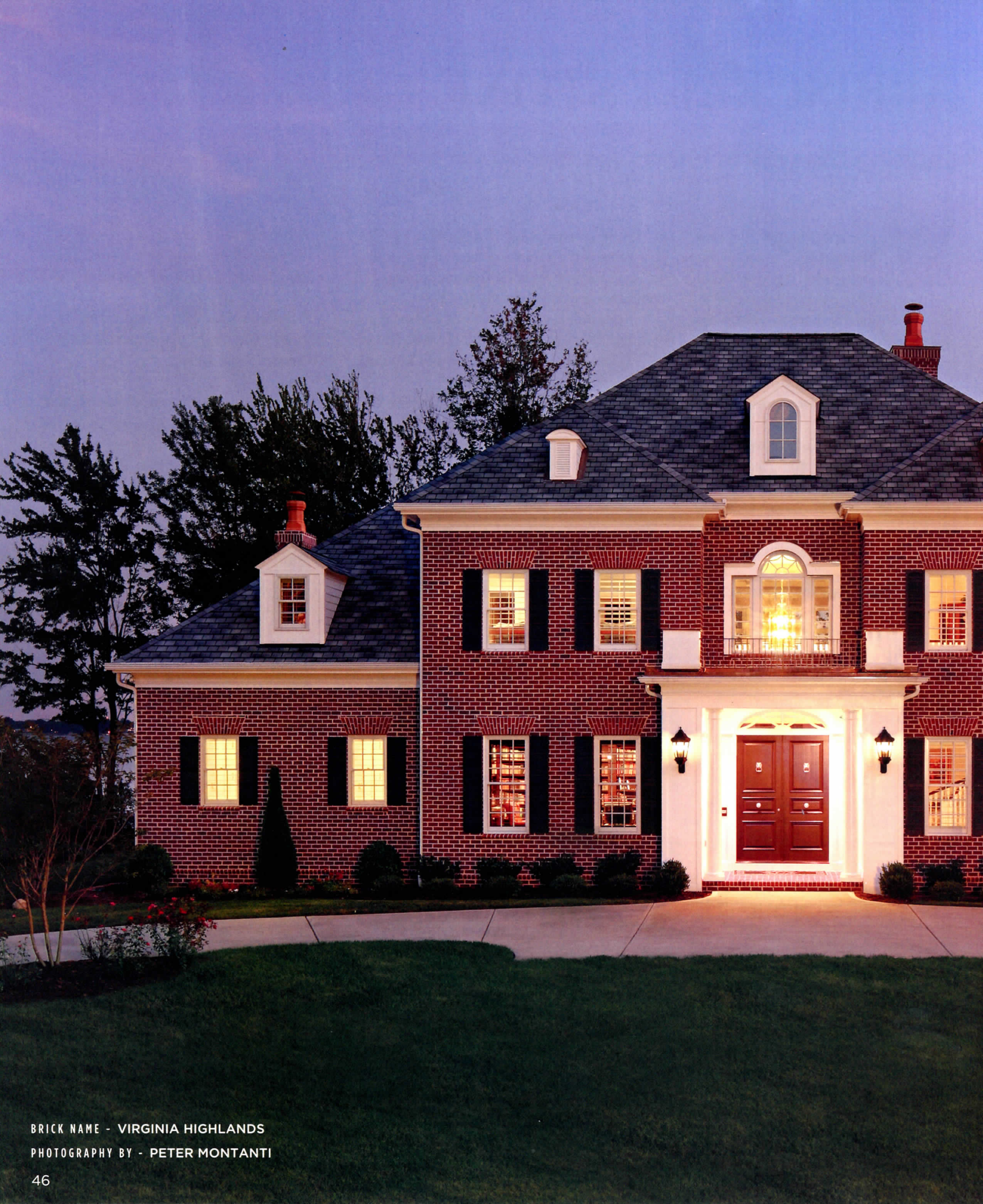
BRICK NAME - VIRGINIA HIGHLANDS