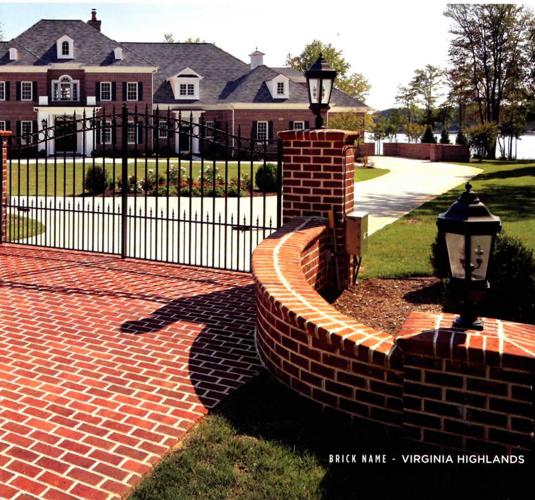
BRICK NAME - VIRGINIA HIGHLANDS