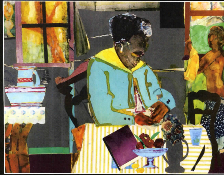
Mecklenburg Evening, 1981, Collage, 14 x 18 inches